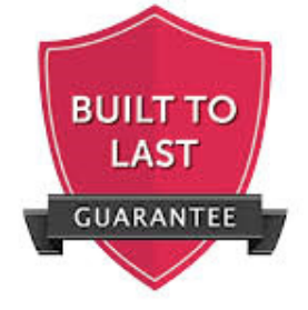
25 YEAR GUARANTEE At the core of our heating