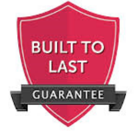
25 YEAR GUARANTEE At the core of our heating